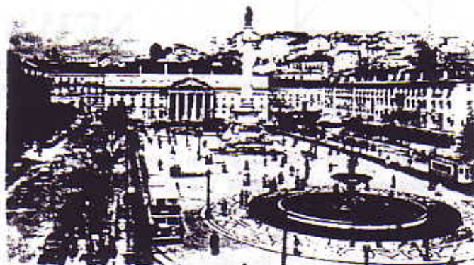
Lisbon, Portugal -- First Tripoli Port-of Call after Re-Commissioning in 1952