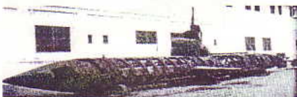
One of the original Japanese one-man submarines was on display at the main gate of the Yokuska Naval Base when the Tripoli visited there in September of 1952.